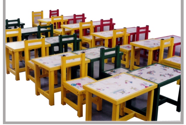
One Seater Chair with Desk

IDEAL FOR PRE-SCHOOL, PRIMARY & SECONDARY SCHOOLS, HOSTELS & HOSPITALS.