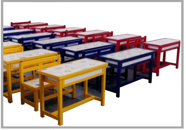
Two Seater Bench with Desk